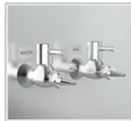
SS Water Tap & Gas Tap