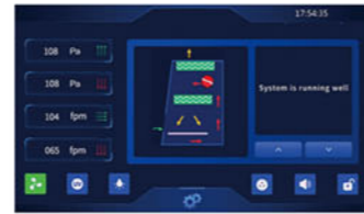
Display for BSC-2FA2-NA