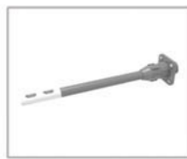
Wind Speed Sensor

Color Touch Screen Touch operation, real-time and clearer display of various values and appointment timing function.