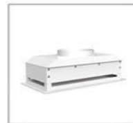
Exhaust Thimble canopy (Optional)