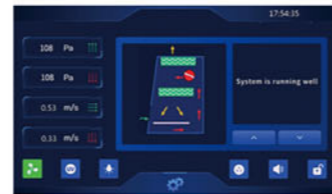
Display for BSC-2FA2-GL

Color Touch Screen Touch operation, real-time and clearer display of various values and appointment timing function.