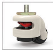
Footmaster Caster Universal caster with brake and leveling feet.